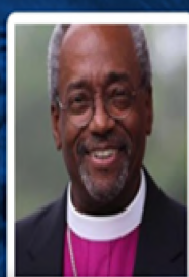
Presiding Bishop Episcopal Church Michael Curry