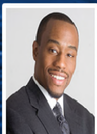
Dr. Marc Lamont Hill